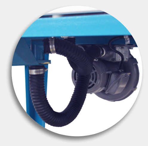
The Accu-Glide features a heavy-duty Max-Air Vacuum Motor standard.