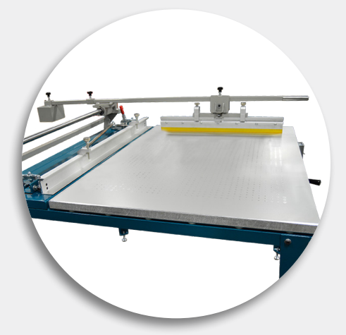
Optional Print Side Arm feature reduces operator fatigue and ensures consistent print stroke and image quality.