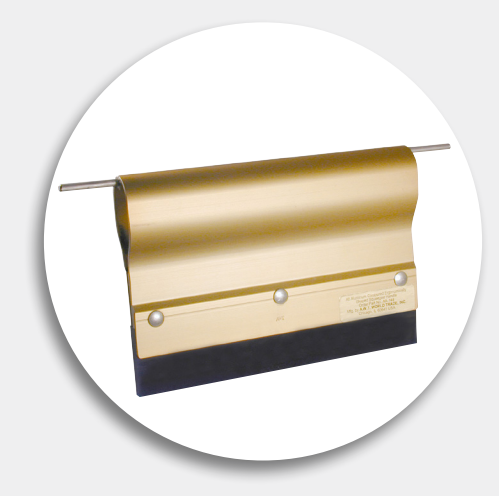
An all-aluminum, ergonomically-shaped squeegee holder with Poly-Supreme<sup>TM</sup>Plus squeegee blade is included with the Accu-Glide.