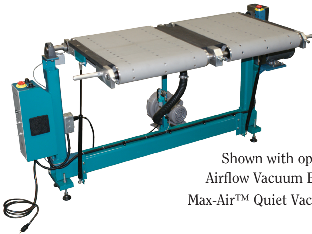
Shown with optional Airflow Vacuum Belts and Max-Air™ Quiet Vacuum Motor