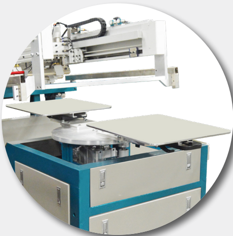
Motor-driven indexer allows high-speed production - output capability up to 800 pph.