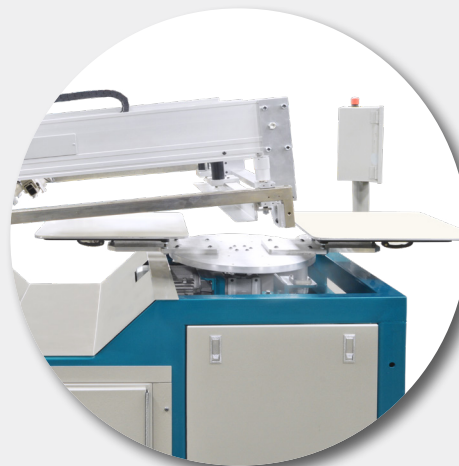
Side view shows motor-driven indexer and easy access to screens and press setup.