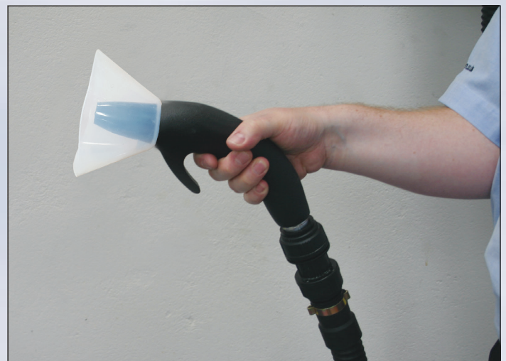
The Jet-Kleen, shown with standard chip guard attachment.

- Jim Parlin, Supervisor, Century Aluminum Corp.